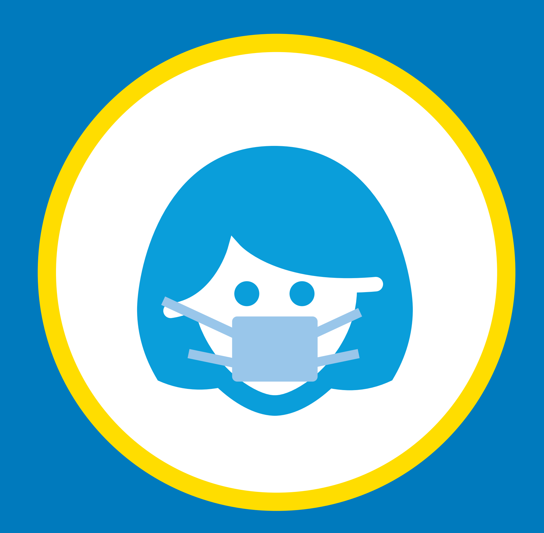
Wear a face covering in shops and on public transport