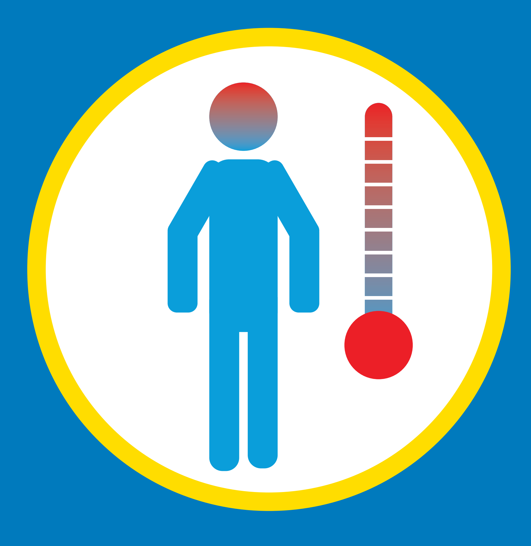
Be aware of fever or chills