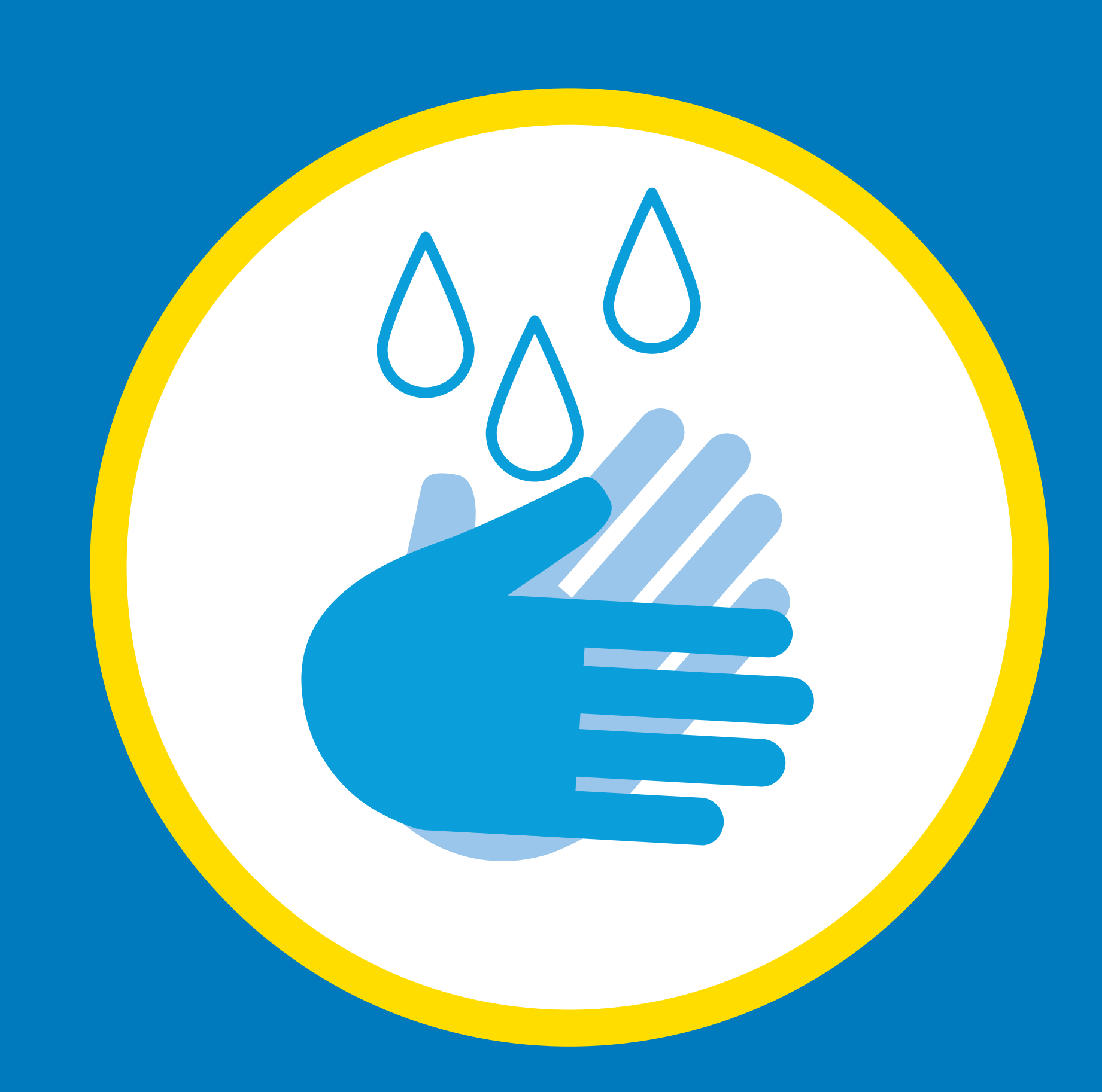
Wash and santising your hands regularly