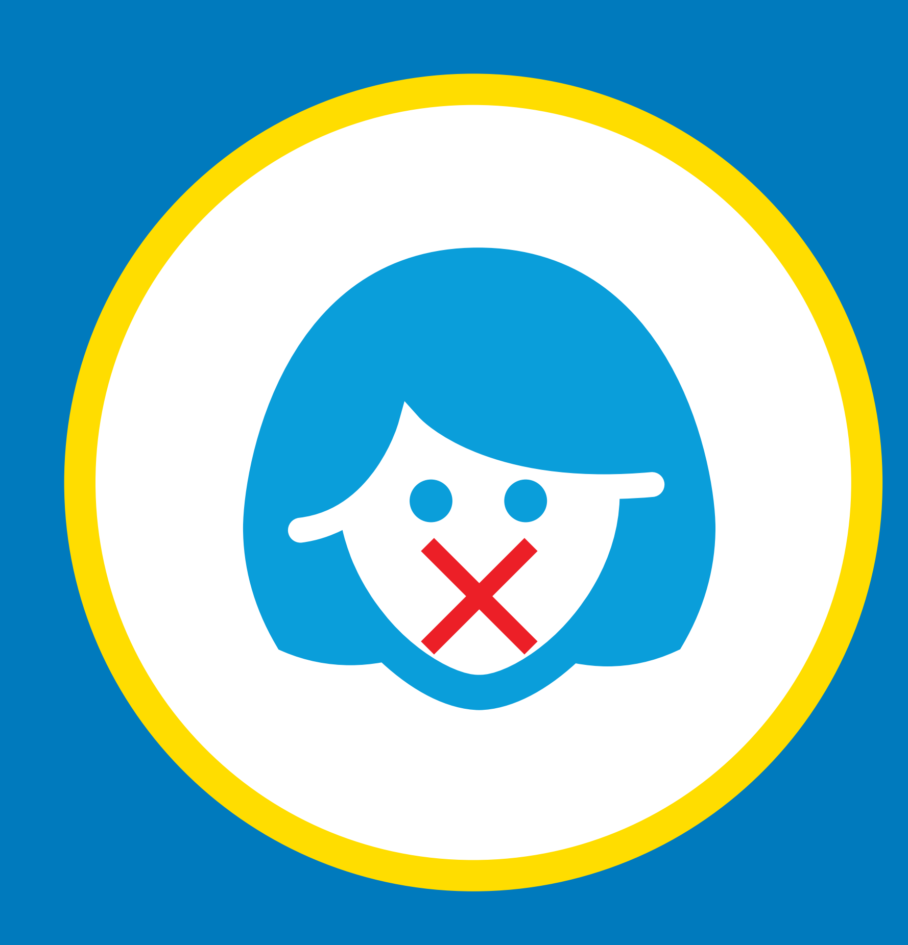
Be aware of loss of taste or smell